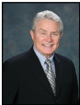
Luis Palau, International Evangelist